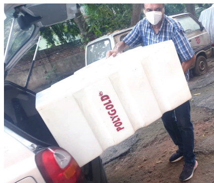
By Interact Club of Pratt Memorial School.

350L overhead tank for water given to Salvation Army old age home, Beniapurkur and Rs 2000 on 2nd November 2020,